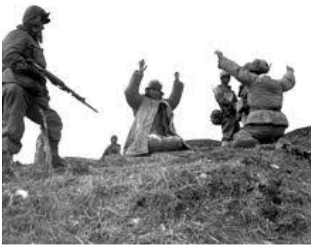
American soldiers hold Chinese prisoners at M4 bayonet point on Korean ridge.