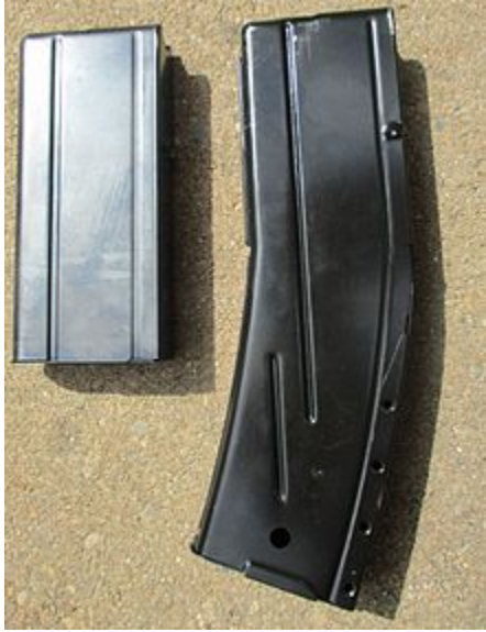
In Korea, the M1 was modified with conversion kits to produce a selective fire weapon, the M2 Carbine. and a thirty-round magazine was introduced.