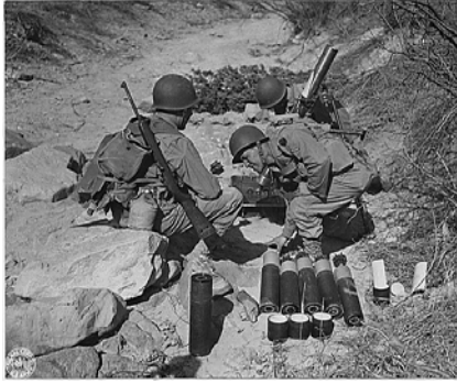
81 mm Mortarmen ready their tubes carbines slung or nearby.