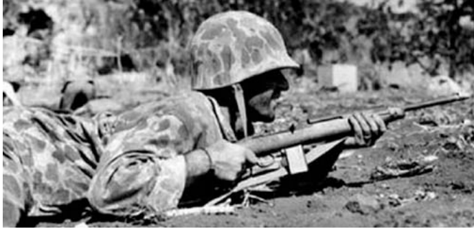
Marine with M1 Carbine, Iwo Jima