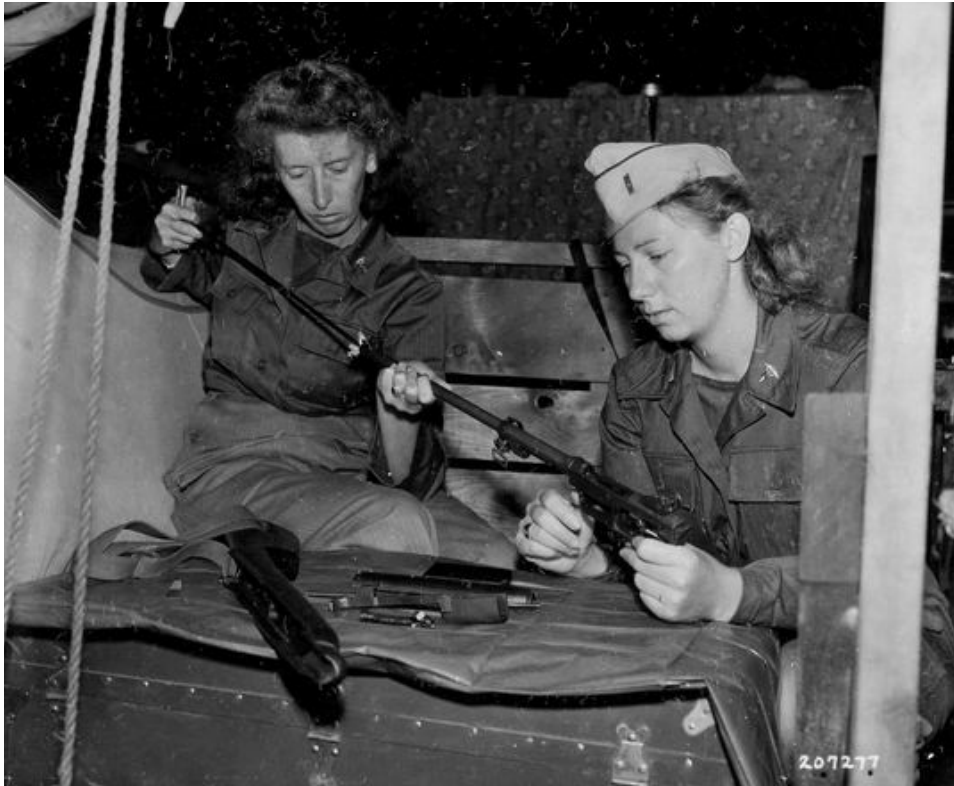
assemble an M1 carbine, 1945 in the Pacific