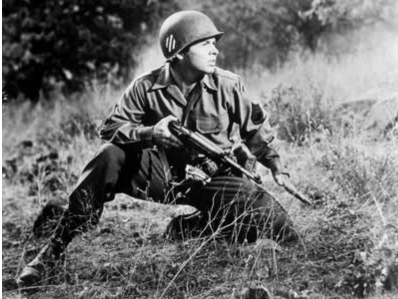
Audie Murphy in To Hell and